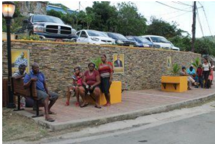
The Stickett community in Long Look.