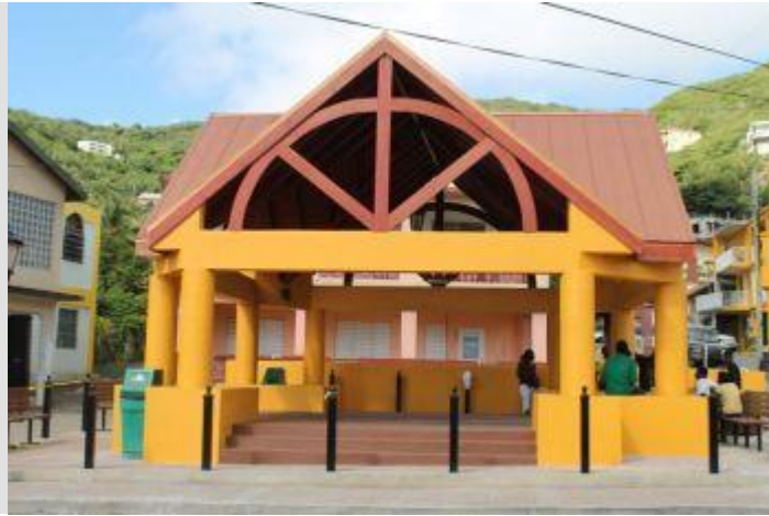
The Stickett.

"This is very painful to me and is a social tragedy," said Hon Fraser, who followed H. Lavity Stoutt and Ralph T. O'Neal OBE as the VIP's third leader.